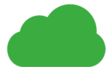
Cloud-based Industrial Robot Monitoring Platform